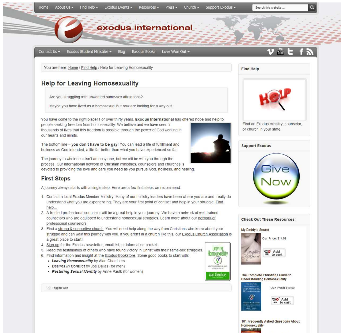
Image 1. Exodus International 'Help for Leaving Homosexuality'

http://exodusinternational.org/find-help/leaving-homosexuality/#.TtRcZ7JCqU8